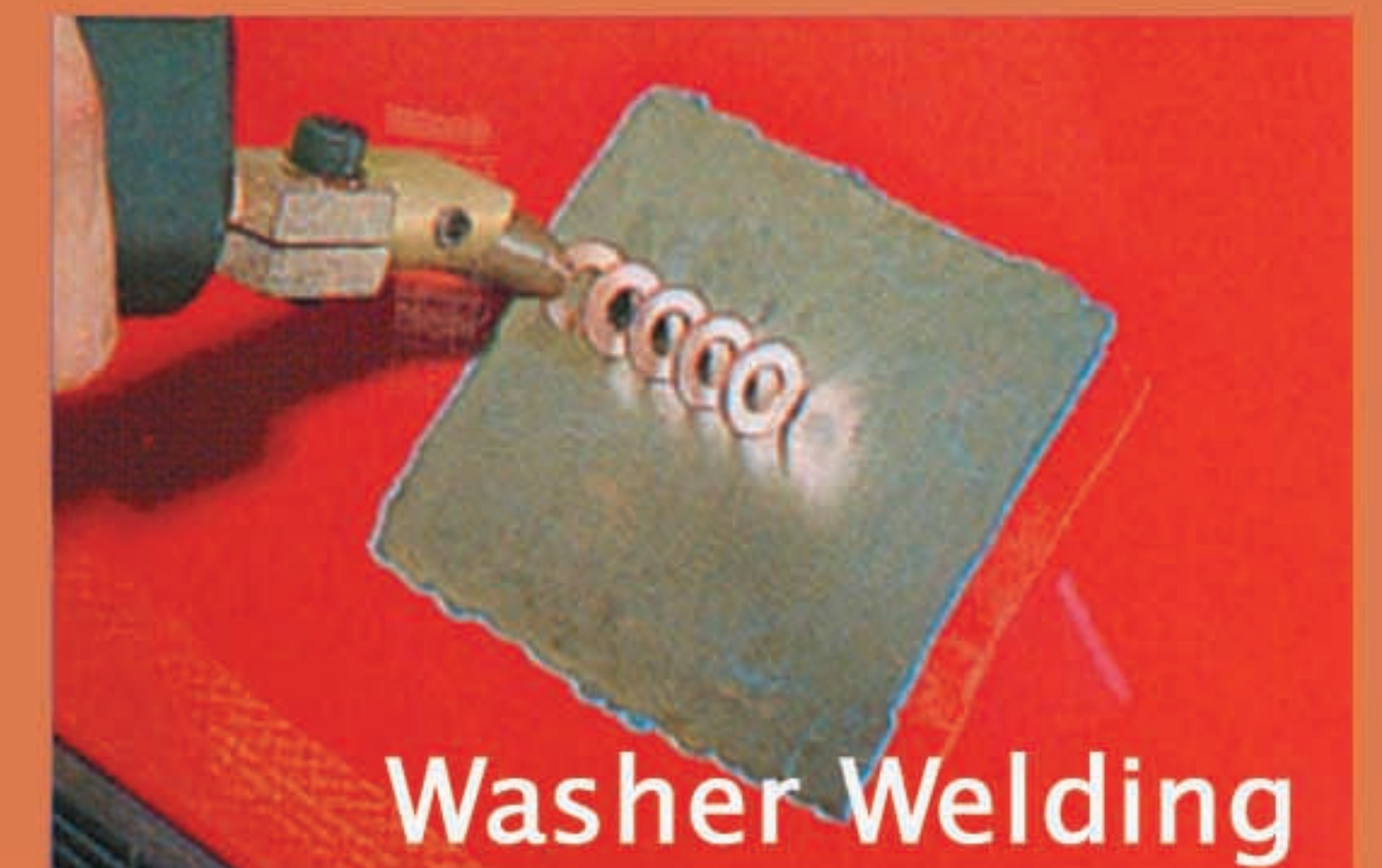
Washer Welding High quality washer welding

Sufficient power to operate the direct puller