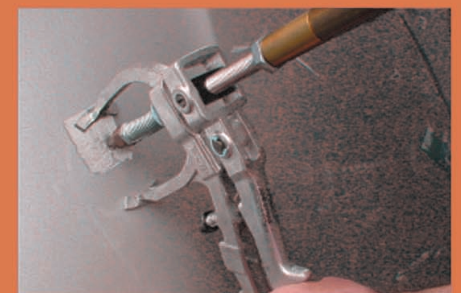
Dent pulling working by using Easy Puller