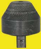
wheel house roll Art-N° 567052