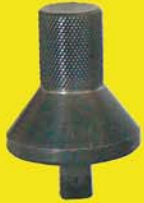
pre shaping roll Art-N° 567053