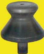
final shaping roll small Art-N° 567054