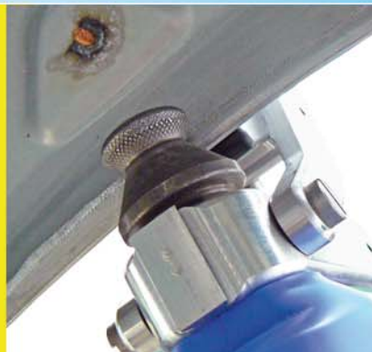
RFW 2000 quick and efficiently