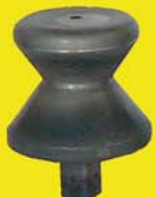
final shaping roll large Art-N° 567055