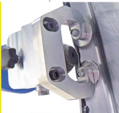
RFW 2000 with wheel house kit Art-N° 562051 (accessory)