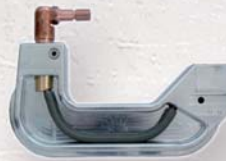
Item N° 495611