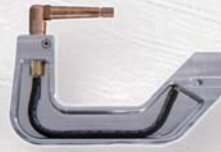
Item N° 495650