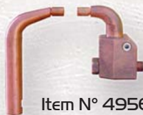
Item N° 495607