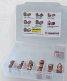
Elektrodes caps set Item N° 497110