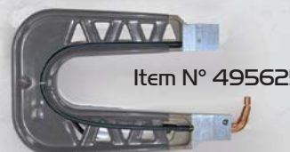
Item N° 495625