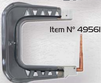
Item N° 495615