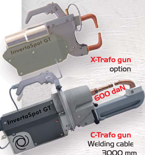
X-Trafo gun option