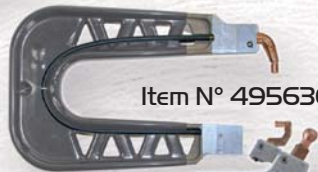
Item N° 495630